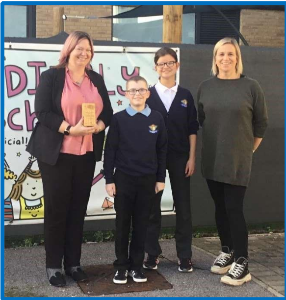
Highfield Littleport with their award

Highfield Littleport were then awarded the prestigious school of the Eastern Region Award and have been invited to London to take part in the Modeshift National Awards event in March 2024. This event showcases the work done in sustainable travel by schools across the whole of England.