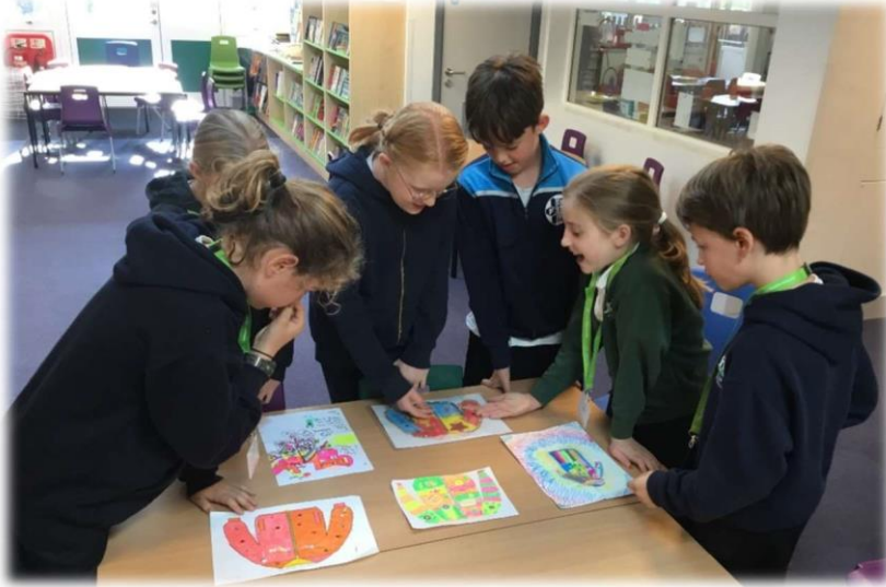
Meldreth Pupils Choosing Winning Design for a bright jacket

Winter months mean fewer daylight hours but people still need to go out and about so it makes sense to do what you can to stay safe. Just a few simple changes can make all the difference, not just for children going to and from school but for everyone.