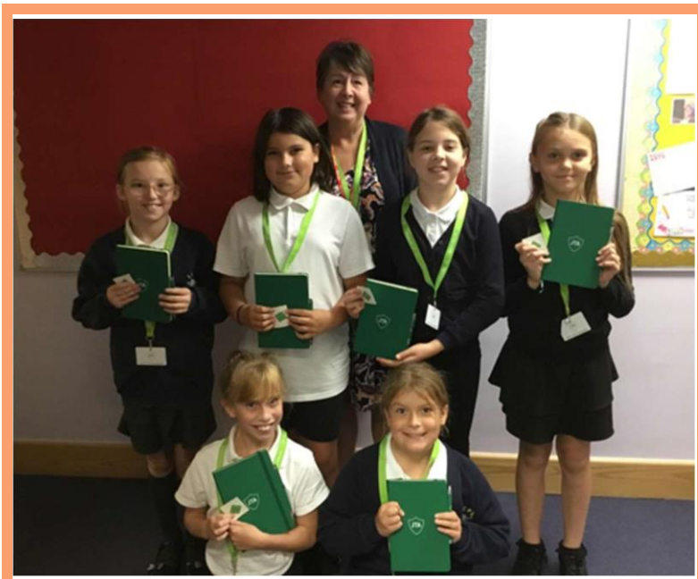
New JTA's at Littleport Community Primary School with their JTA notebooks, pens, badges and lanyards